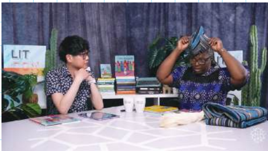
Yoruba Culture Show and Tell

What are some important qualities that make a good leader?